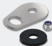
SAFETYPRO ANCHOR POINT HEAD AND CONNECTOR SET