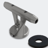
SAFETYPRO WIRE ANCHOR HEAD SET