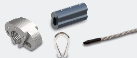
SAFETYPRO FIX ACCESSORIES